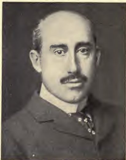
JOHN KENDRICK BANGS